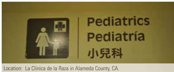
Location: La Clinica de la Raza in Alameda County, CA.

A number of studies have examined wayfinding issues in detail. 19–22 However, few have scrutinized wayfinding design for multicultural health care settings, such as safety-net clinics, where a majority of the patients and families may not be proficient in English. Strategies such as color-coding departments and incorporating landmarks at key decision points have been used effectively in safety-net clinics and other health care settings. But these techniques sometimes fail when facilities add new wings or undertake renovations without carrying through existing wayfinding patterns.