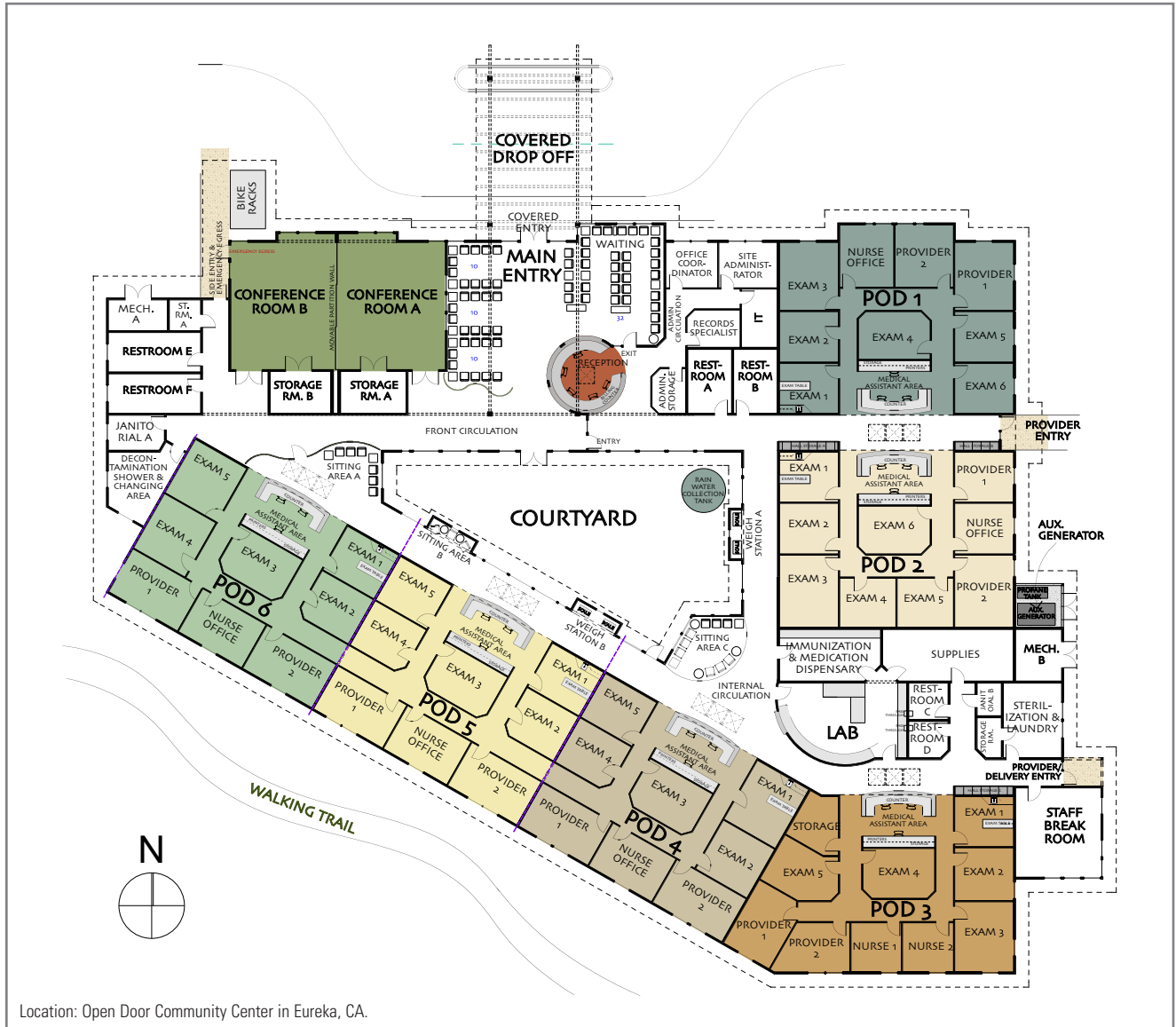
Figure 4. One Larger Exam Room Incorporated in Each Pod to Accommodate Bigger Groups

Location: Open Door Community Center in Eureka, CA.