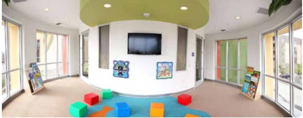
Figure 3. Family Area Designed for Participation

Location: La Maestra Community Health Center in San Diego, CA.