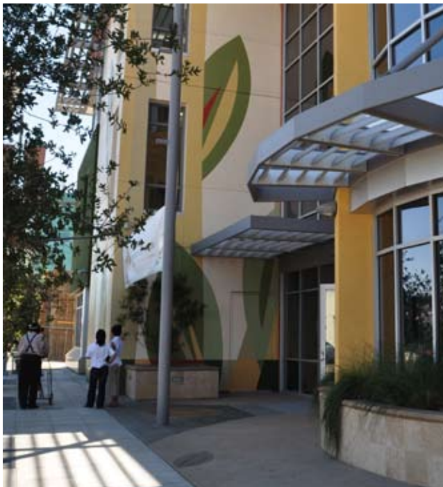
Figure 2. La Maestra Community Health Center in San Diego, CA