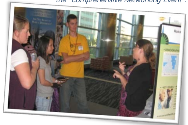
Colorado Rural Health staff with students at the "Comprehensive Networking Event".

Visit the NHSC Corps Community Day webpage to view videos of NHSC providers and obtain information and tools to prepare for next year's Core Community Day.